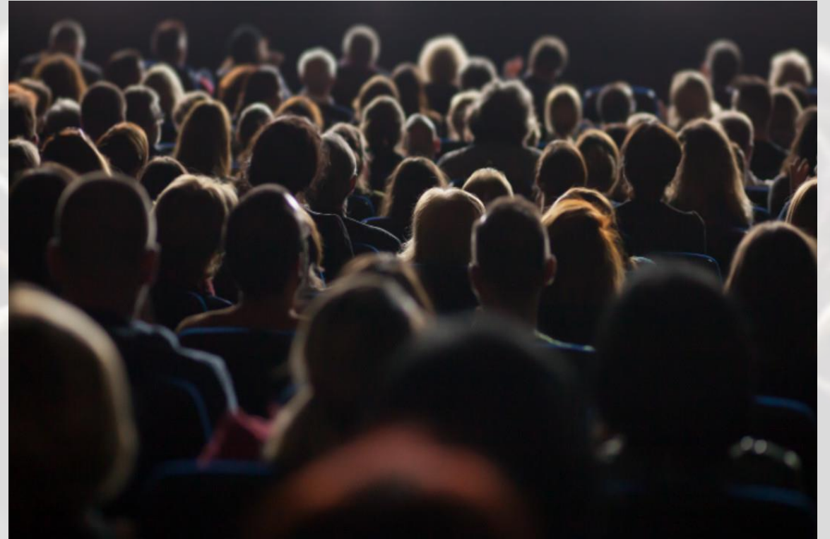
Background photo developed in Microsoft Designer